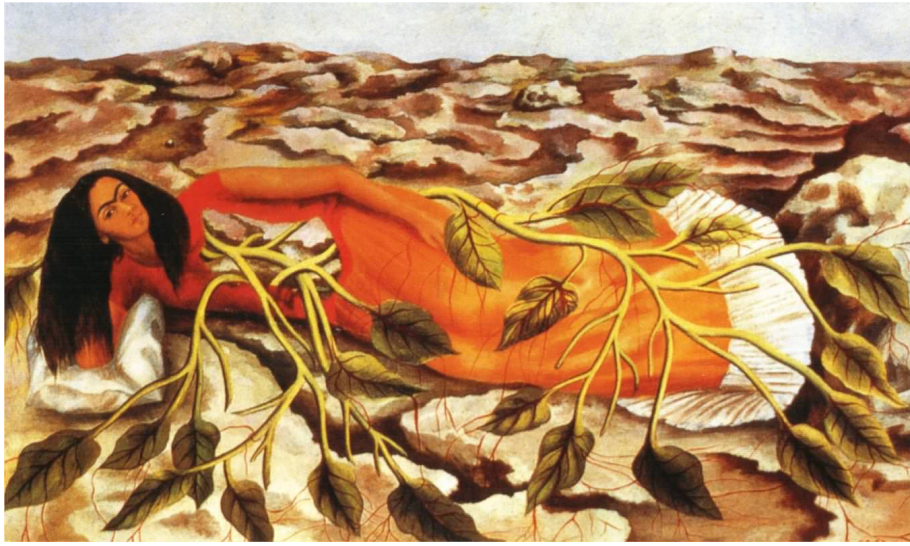
Roots, Frida Kahlo 1943