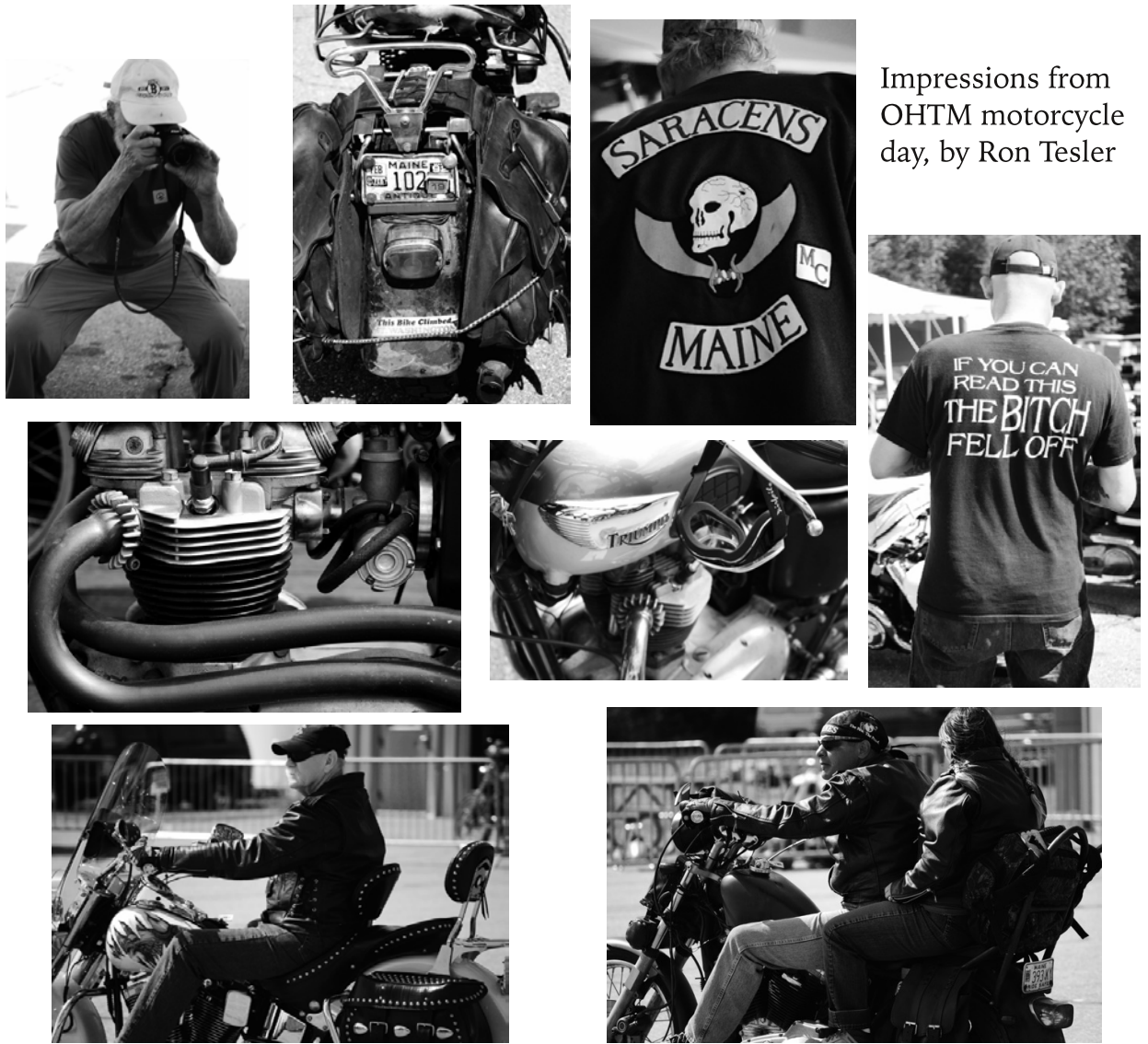
Impressions from OHTM motorcycle day

his rightful power. He sort of wins in the end, pulling down a temple on everyone's head including his own. The front of the temple with its row of columns has an uncanny resemblance to the Supreme Court building. Well, it is a temple of justice I guess. Could the analogy be carried to a day when this new justice votes to overturn Roe v Wade and the reaction across the country, the loss of confidence, erodes the perceived objectivity of the court? The columns symbolically collapsing around this critical third tier of the National government? I hope not. As you read this the Senate committee has voted up or down the nominee. The Senate will then confirm and Justice Kavanaugh will be on the highest court in our legal system for more years than I expect to be around. As I write this over a thousand professors of law at universities all over the country have sent a petition to the Senate committee asking that the candidate not be confirmed. They cite his temperament as reason - not any alleged indiscretions around sex and drinking. They are uncomfortable with his statements that one of the political parties is out to get him. His statement that Bill and Hillary are out to get him. Statements like this are fine and expected of a political actor but absolutely NOT from judge who will be ask to make law relating to political controversies. Cesar's wife need not just be pure but appear and act pure. The same for a judge. How will we expect him to be impartial now? Simple...we wont.