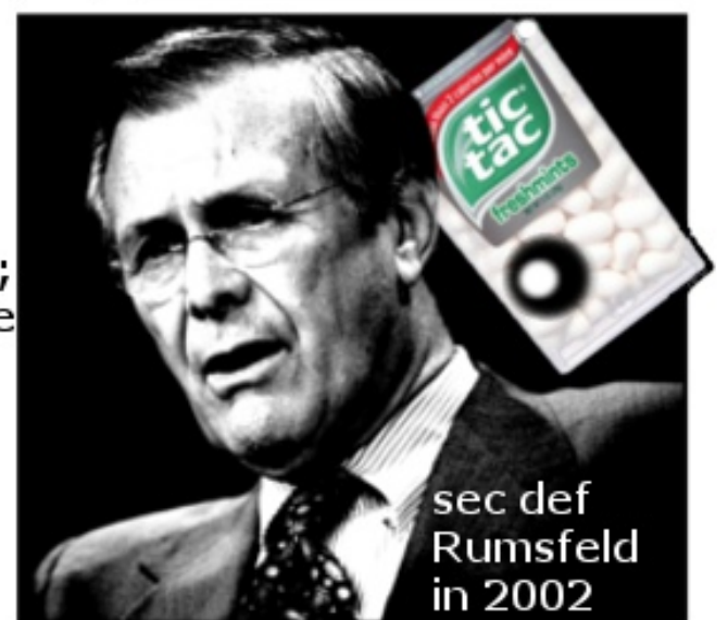
sec def Rumsfeld in 2002