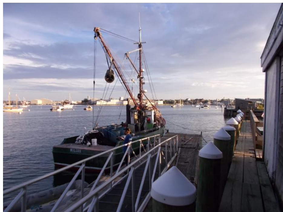
Rockland harbor, South End

Many of these followers, according to media reports, are posting highly enraged and violent reactions, with assault and death threats.